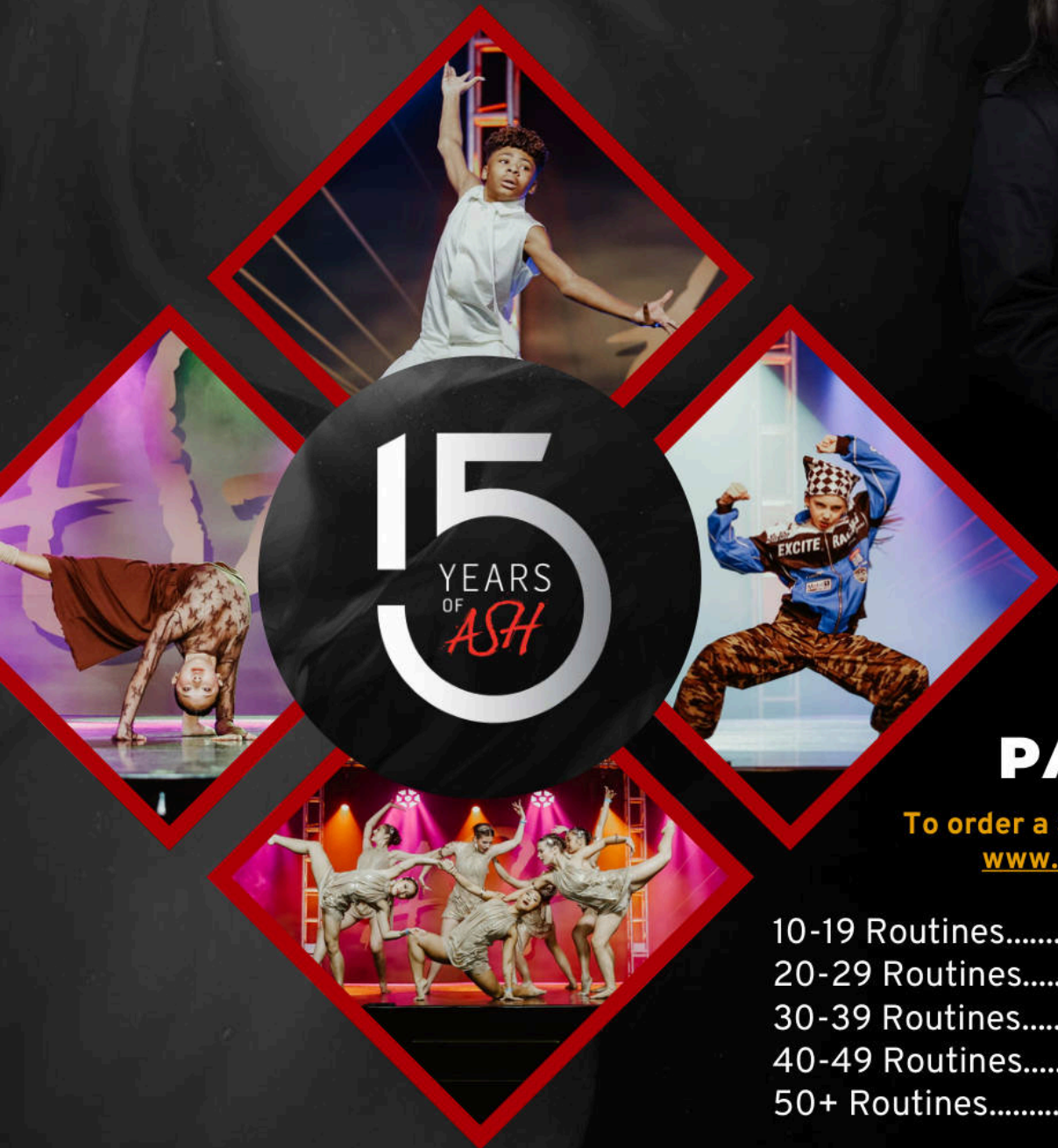
PHOTO VIDEO STUDIO PACKAGES

To order a Studio Package, visit www.ASHPhotoVideo.com